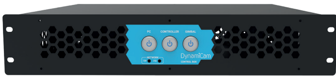
New 2U lightweight Control Box