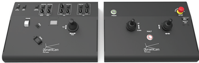
Camera, Pilot Consoles and GUI