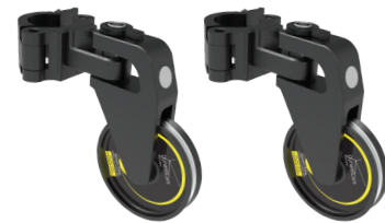
New Dynamic Pulleys