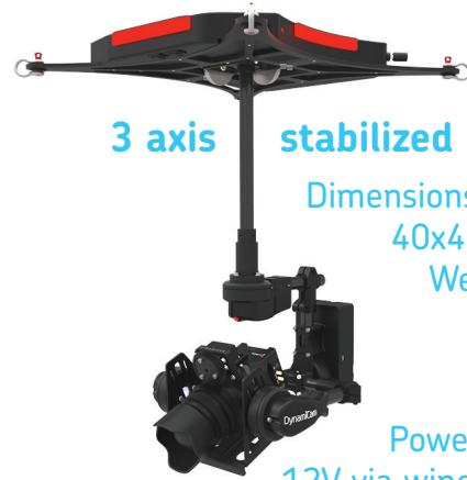
3 axis stabilized Gimbal